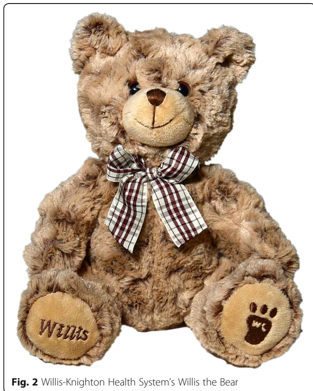
Fig. 2 Willis-Knighton Health System's Willis the Bear

A logo-bearing ink pen handed out to the patients of a dermatology clinic likely will be appreciated and serve as a useful reminder by those receiving such, but it will not generate the kind of interest and attention that more sophisticated sales promotion incentives can elicit. Consider, however, a discount coupon for laser vision correction services placed in an eye clinic's advertisement, an online advertisement offering a chance to win an all-expense paid trip to a major sporting event in exchange for attending a sports medicine clinic's seminar on the latest orthopedic surgery techniques, or a direct mail parcel noting that all who attend a heart institute's