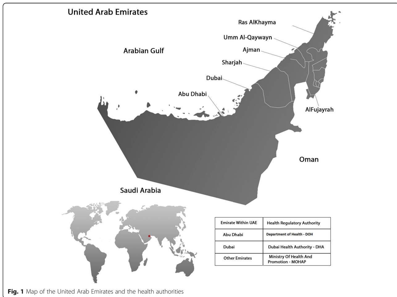
Fig. 1 Map of the United Arab Emirates and the health authorities

Many previous studies identified nursing research priorities using consultative processes that included: key medical, health policy, academic, and allied health