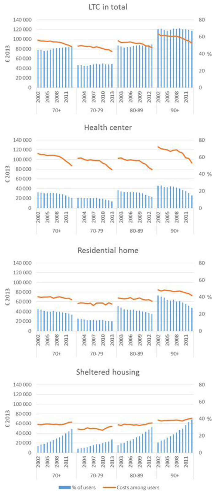
Fig. 2 The proportion of LTC users out of all decedents, and the mean costs of LTC (€ 2013) among users by age group from 2002 to 2013 (the costs of health centers are higher than those of LTC in total, since the number of days in a health center varies from 90 to 730 and for other types of LTC from 1 to 730)