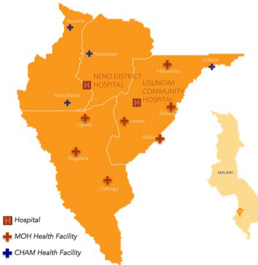
Fig. 2 Map of Neno District, Malawi and location of healthcare centres