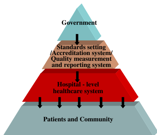
Figure 1 Healthcare Systems Hierarchy.

For the purposes of this paper the overall healthcare system may be simplified to a 4-layer model shown in Figure 1. Inter-layer relationships are characterised by vertical control and communication, but the full regulatory structure also includes significant horizontal interrelations as well as self-regulation. The proper functioning of all these relationships is important to the ultimate achievement of quality health care [19]. The focus of this paper is on the middle two layers, the health administration system, with its two sub-systems - the accreditation system and the quality measurement and reporting systems - in relation