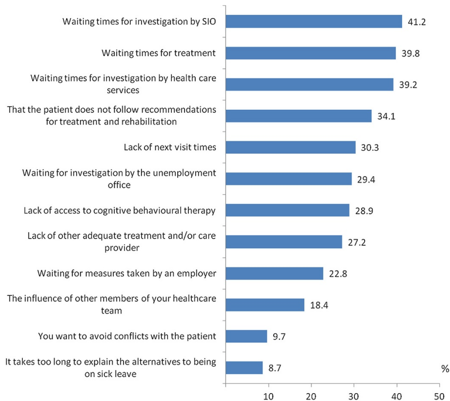
Figure 3 Percentage of psychiatrists (N=579) who, for different reasons, issued sickness certificates for unnecessarily long periods at least once a month. (SIO is Social Insurance Office).