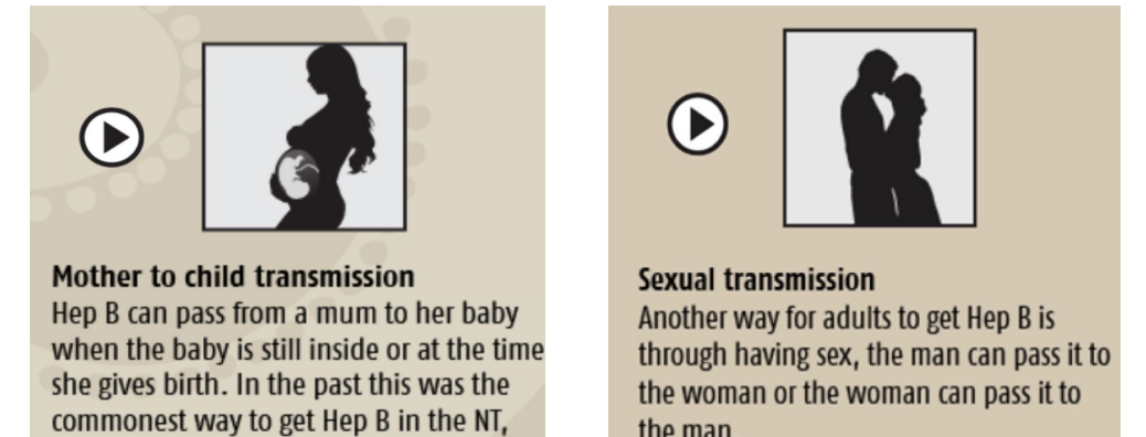
Fig. 5 Images associated with information on A mother-to-child and B sexual transmission of hepatitis B

now there are lots of things we can do to