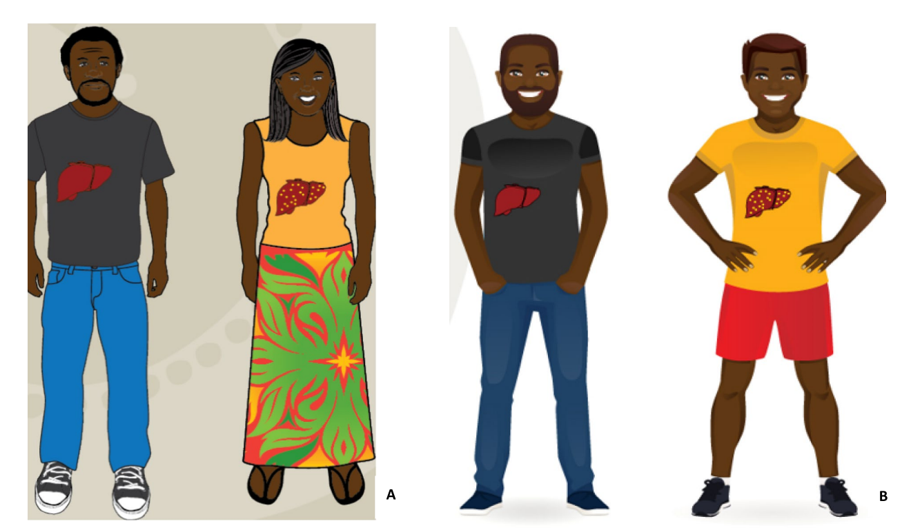
Fig. 4 Picture of a woman with liver nodules (A) has been changed to a man with liver nodules (B)

"Kissing picture not good, pregnant tummy not good, rest ok".