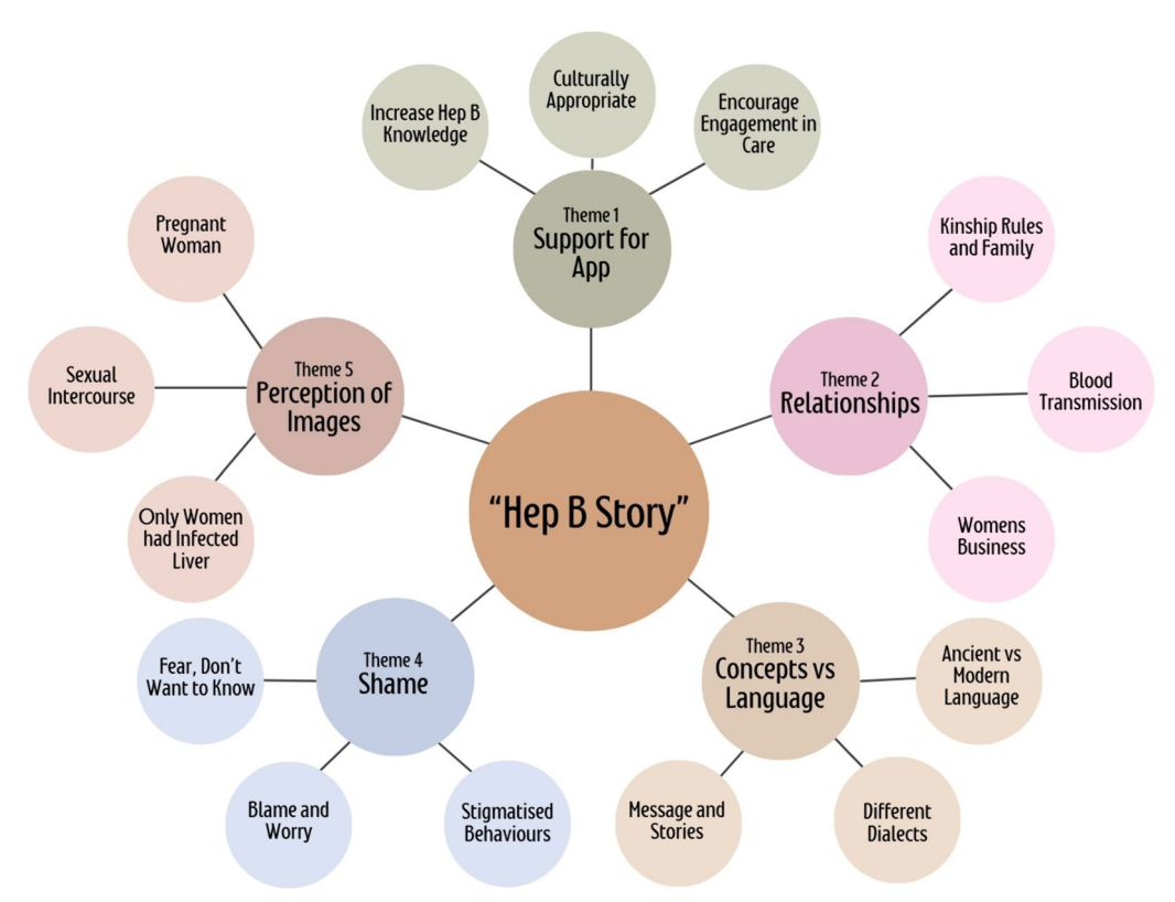
Fig. 1 Thematic diagram representing the five distinct themes and their subthemes