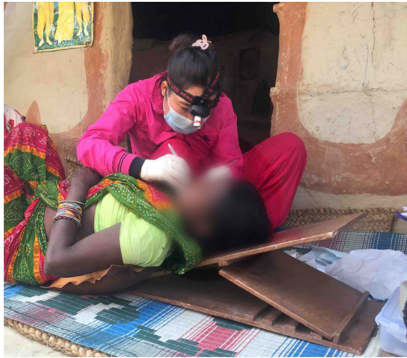
Fig. 1 Auxiliary nurse midwives conduct periodontal examinations on study participants at their homes in a rural area of Sarlahi District in the Terai region of Nepal

assistant traveled to participants' homes by motorbike, carrying with them all of the equipment required to conduct the exam. After the consent process, auxiliary nurse midwives asked the participant where in the home they felt most comfortable having the examination. A location was selected by the auxiliary nurse midwives to conduct the examination that maximized the available natural light and participant privacy. Often examinations were conducted inside the house on a bed or the floor in dim lighting. Ideal conditions were found in households with an enclosed courtyard, allowing for the exam to be conducted outdoors on the porch or ground, providing the most natural light. Electric lighting was present in very few households, and whether examinations were conducted inside or outside, auxiliary nurse midwives relied on battery-powered headlamps to illuminate the mouth.